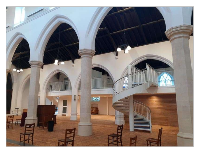
The spiral staircase to the mezzanine level

choirs, and civic bodies such as the British Legion, are already planning to make regular use of the excellent facilities available.