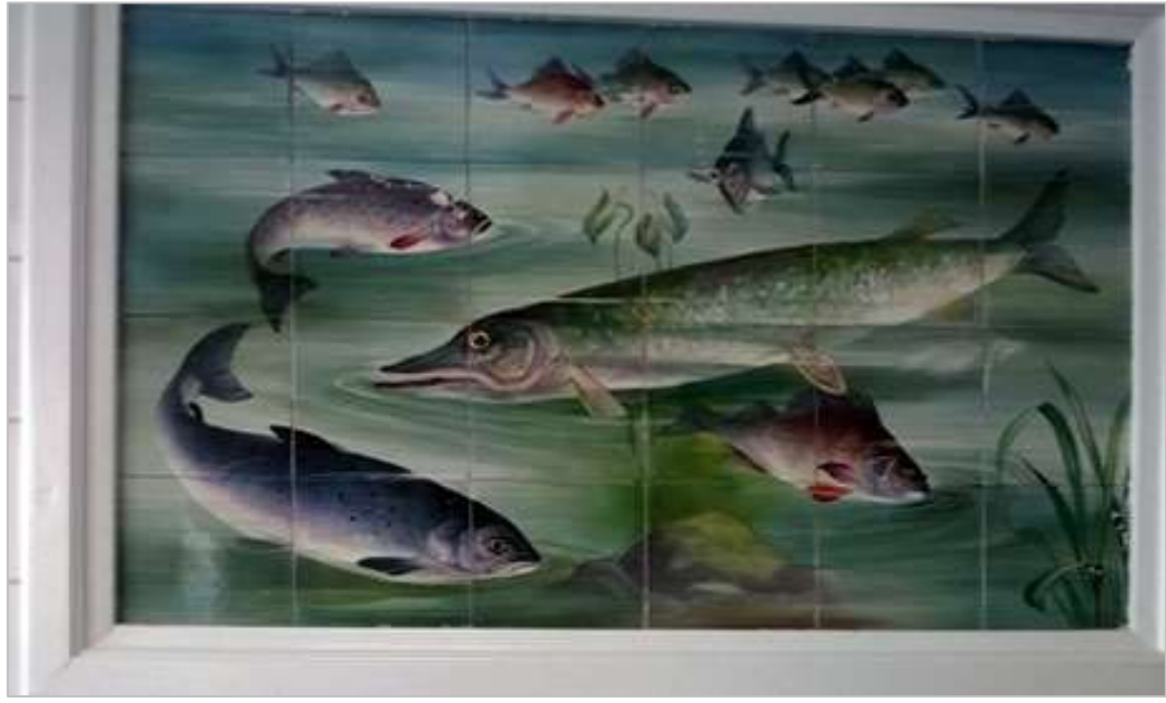
Wall Mural, Webbers, Canon Street