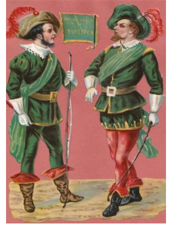
Illustration: Victorian Scrap showing members of the Ancient Order of Foresters.

( Cardiff and Merthyr Guardian , August, 12, 1864.)