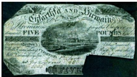
Fragment of an iron company £5 bank note.

A REMARKABLE CONFIRMATION. —A remarkable confirmation was held at St. Lleurwg's Church, Hirwaun, on December 3rd, 1888, by the Bishop of Llandaff. The list of candidates included 'twenty men, of whom five were Wesleyans, aged respectively 27, 58, 21, 44, 30, one being a local preacher, and two others, "members;" two were Baptists, aged 28 and 12, the first being a "member;" two were Independents, aged 62 and 30, both "members;" two were Calvinistic Methodists, aged 32 and 21; of the remainder, one Oburohman was aged 69, another 52, and a third 50. Nineteen women were confirmed, and of these 3 were Wesleyans, aged 32, 57 and 25, all "members;" seven were Independents, aged 27, 27, 37, 26, 47 and 23 (the age of one is not given), five being "members;" one was a Methodist "member," aged 41; two, aged 50 and 27, were not going to any place of worship; of the Conchleians, so-called, one was 66, another 59, and another 44. Twenty-two boys and girls were confirmed, of whom two were Roman Catholics, two Wesleyans and one a Methodist.